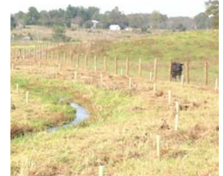
A Buffer Note from Bobby Whitescarver, NRCS

production and establish forested riparian buffers to improve water quality. CREP provides cost-share money to establish alternate water sources, build fencing to keep cattle out of streams, build stream crossings if necessary, and plant trees along the stream. The farmer will also receive a rental payment for a period of either 10 or 15 years for the acreage taken out of production. Continuous sign up: Farm Service Agency and NRCS office (Verona) Projects covered: Establishment of alternate water source, Fence building, Tree Planting. Note: CREP also has grass buffer and easement options.